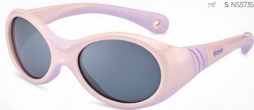
colour Light pink/lilac lense BlueBlock ™ +Anti-reflection + Anti-scratch