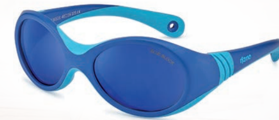
colour Matte Blue/turquoise lense RVO blue + BlueBlock ™ +Anti-reflection +Anti-scratch ref. XS: NS56533 ref. S: NS57533