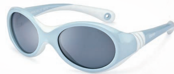
colour Light blue/white lense BlueBlock ™ +Anti-reflection + Anti-scratch ref. XS: NS56330 ref. S: NS57330