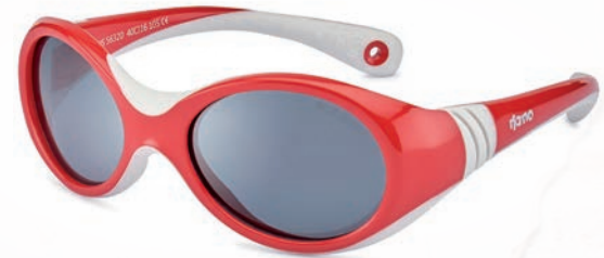
colour Red/grey lense BlueBlock ™ +Anti-reflection + Anti-scratch ref. XS: NS56320 ref. S: NS57320