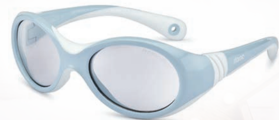
colour Light blue/white lense Photochromic Cat. 1-3 + BlueBlock ™ +Anti-reflection + Anti-scratch/Oleophobic ref. XS: NS56130 ref. S: NS57130