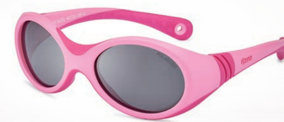
colour Matte Pink/raspberry lense Polarized+Anti-reflection ref. XS: NS56251 ref. S: NS57251