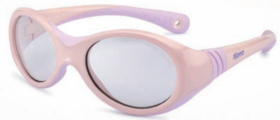
colour Light pink/lilac lense Photochromic Cat. 1-3 + BlueBlock ™ +Anti-reflection + Anti-scratch/Oleophobic ref. XS: NS56150 ref. S: NS57150