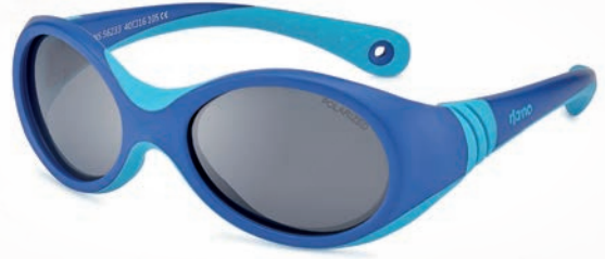
colour Matte Blue/turquoise lense Polarized+Anti-reflection ref. XS: NS56233 ref. S: NS57233