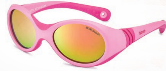
colour Matte Pink/raspberry lense RVO pink + BlueBlock ™ +Anti-reflection +Anti-scratch ref. XS: NS56551 ref. S: NS57551