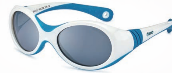
colour White/turquoise lense BlueBlock ™ +Anti-reflection + Anti-scratch ref. XS: NS56301 ref. S: NS57301